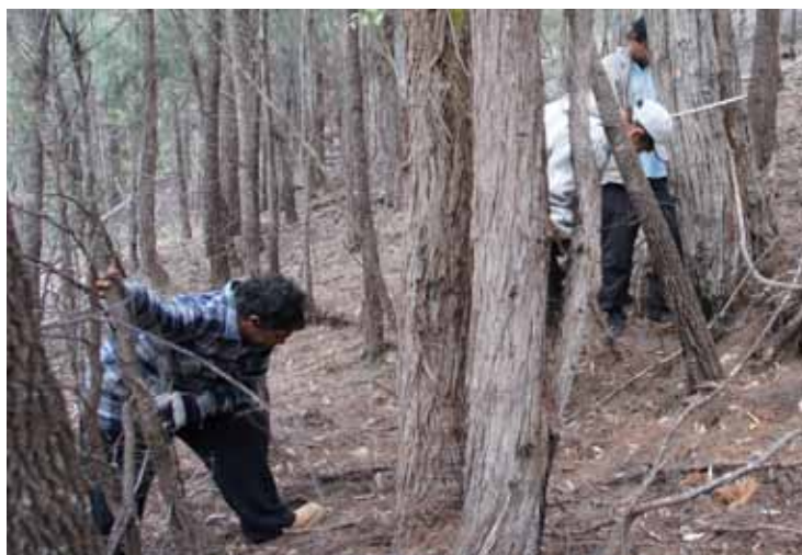
Figure 9. Survey personnel check a thirty-tree plot as part of the scientific investigations of the survey. Of over fifty thirty-tree plots along the route, more than half were found to contain artefacts. Tree species were noted, as well as size, animal activity and such. Unfortunately, no certain sign of Koala was found.

The survey also checked overall track conditions along the heritage route to ensure it would be safe for walking, and, if not, whether there is a safer alternative. One dangerous leg was identified along an unsealed section of Towamba Road on the Heritage Route therefore a safer alternative walking route was surveyed as well.