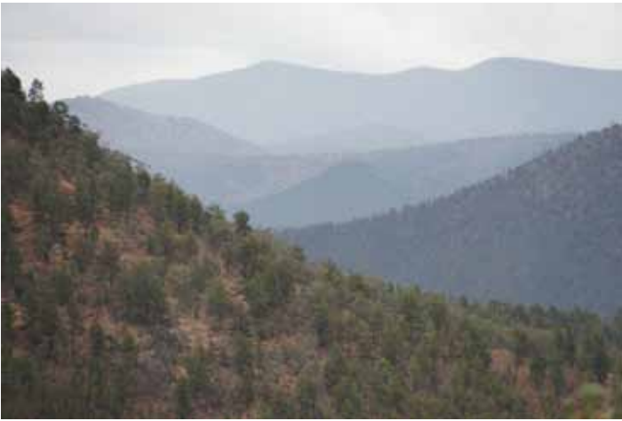
Figure 15. The most difficult leg of the Bundian Way is through Byadbo. Steep and hard-going, this Snowy River country is remarkably beautiful.

necessary. Byadbo Wilderness suffers extremes of hot and cold. No water should be expected after the Snowy, and in dry times none might be available until Corrowong Creek, at least four day's walk away. It is a very, very long way from the nearest shops. Any water, creek or dam water, is likely to be of poor quality and might need to be treated.