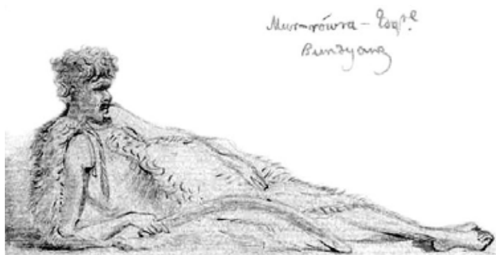
Figure 6. 'Mur-rowra Esquire - Bundyang' was drawn by OW Brierley in 1843. Looking very relaxed in his possum-skin cloak, he apparently moved readily between Twofold Bay and his country at Bundyang (also spelt Bundian, Boondiang, Bondi etc) about the upper headwaters of the Genoa River where many species of possums and small marsupials were plentiful. Of several passes in the district, the Bundian Pass led most directly and easily to the coastal districts.

While the Bundian Way is only part of the wider network of old Aboriginal pathways across the region and the continent, it is the best preserved of the old east-west routes of south-eastern Australia. It connects Targangal (Kosciuszko) and Bilgalera (Fisheries Beach) on Tullemullerer (Twofold Bay) following the route that brought together the people of the greater region, most notably for gatherings associated with whales in springtime at the bay and Bogong moths in the high country during summer. A succession of Aboriginal landscapes including lower parts of Nurudj Djurung (the Snowy River) and some of the wildest, most rugged, culturally rich and beautiful country in Australia feature along the way.