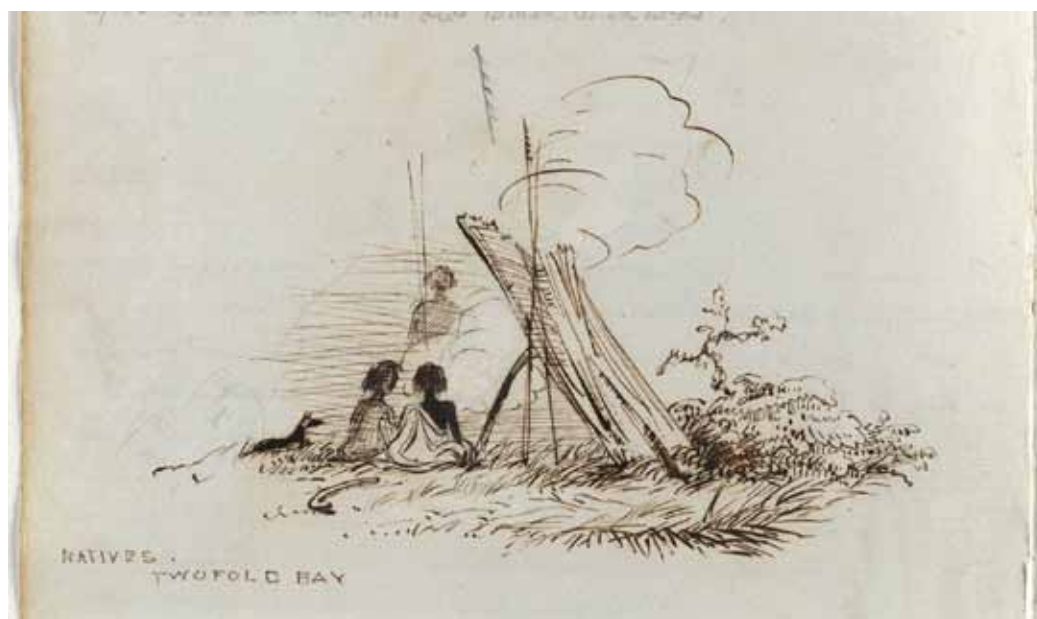
Figure 11. Brierly drew 'Natives- Twofold Bay' soon after his arrival on Twofold Bay

Artefacts were found very frequently along the old sections in the wilder places, often at intervals of less than 10m, even along the graded tracks. Where the tracks became simple unsealed country roads, signs were still there but less