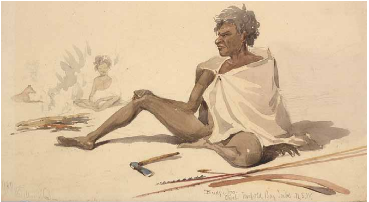
Figure 21. Budginbro Chief Twofold Bay Tribe - Painted by Oswald Brierly Twofold Bay 1843. Mutual respect and friendship between the two men has meant a lot of information was passed down for the benefit of future generations, including place-names and the old way from the bay to the Towamba valley through the rugged coastal range.