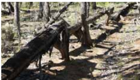
Figure 13. In Byadbo an old settler fence still stands beside the Bundian Way. Its survival is probably due to the dry, rain-shadow conditions and termite-proof resins of the cypress logs.

through the forest. An old campsite at its foot overlooking the grassland of Sheepstation Swamp was on 10th Feb 1987, described in the Sydney Morning Herald as 'the most important Aboriginal artefact site on the far South Coast of NSW'.