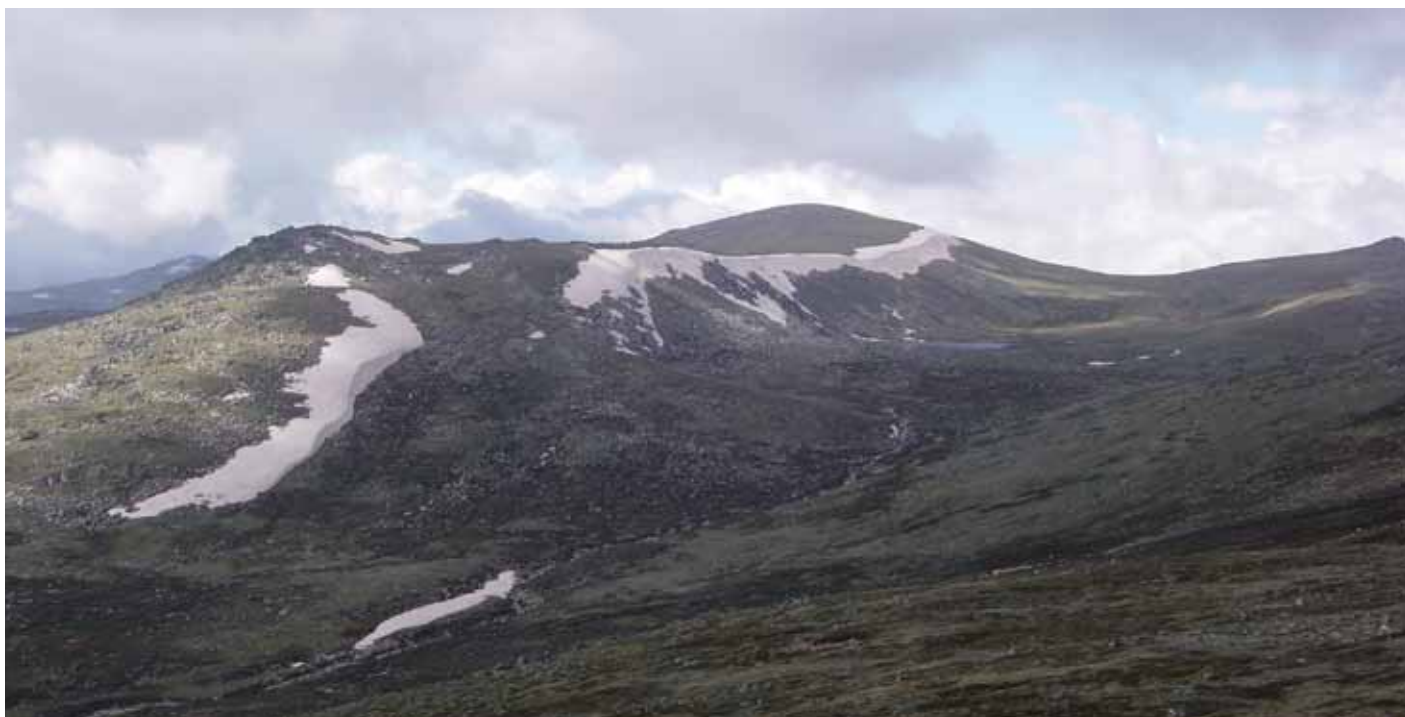
Figure 3. Springtime at Mt Kosciuszko. Looking back towards the highest peak from further along the Bundian Way and Great Divide. The route presents spectacular mountain landscapes and Alpine scenery that change throughout the year. The peaks were visited respectfully by the Aboriginal people round the beginning of summer, when the Bogong moths arrived in the granite peaks.

Total length of the Touring Route is 335km while the Heritage Route from Targangal (Kosciuszko) to Bilgalera (Fisheries Beach) is 265km.