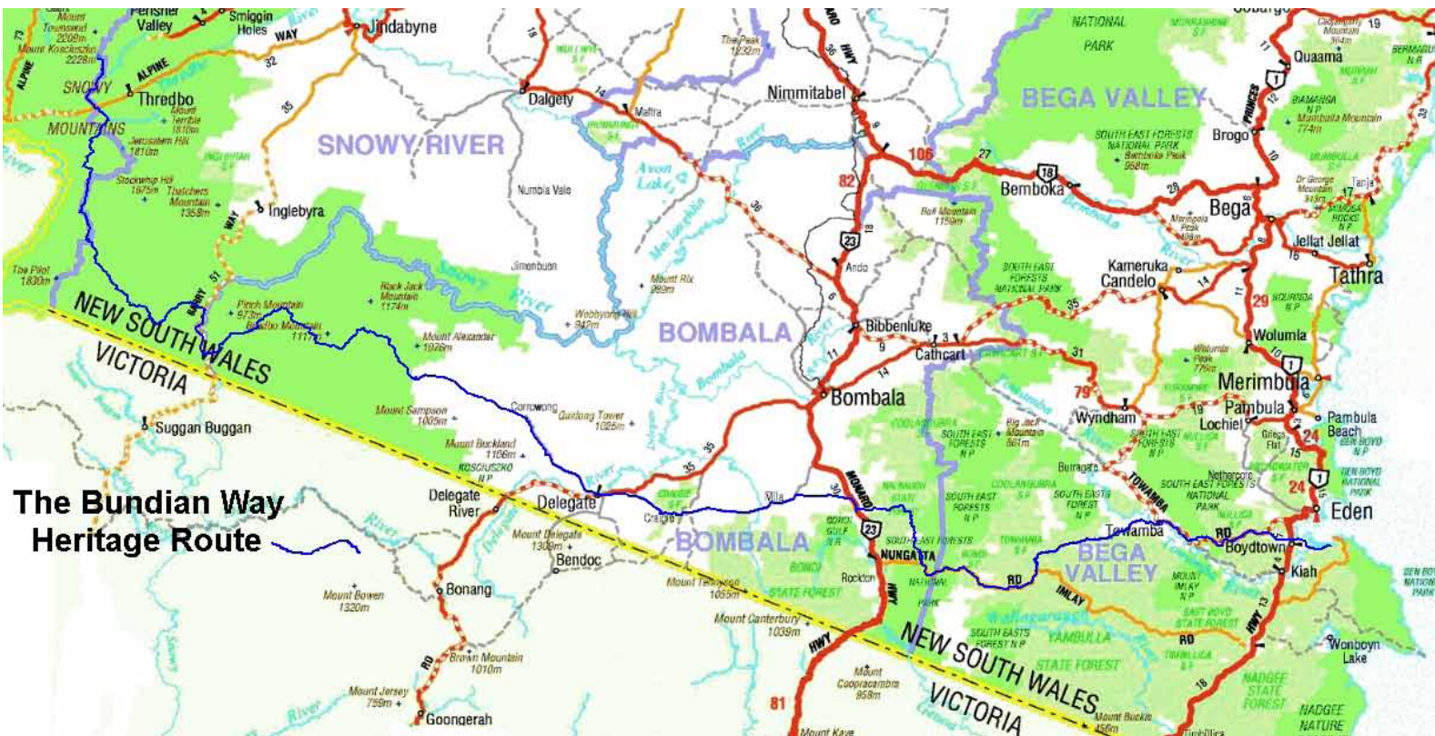
Figure 2. Bundian Way Heritage Route. (marked blue)