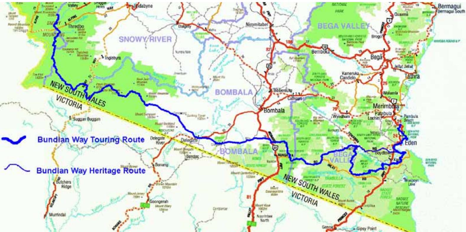
Figure 1. Bundian Way Touring and Heritage Route