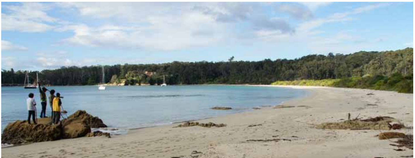
Figure 4. Survey crew at Bilgalera (Fisheries Beach) on Twofold Bay today. The area is Aboriginal land, currently used as a primitive camping area and proposed as major cultural education centre. Edrom Lodge (centre) is where Ben Boyd’s manager, the artist Oswald Brierley, built his home in the 1840s. Today Edrom Lodge has replaced it and the chipmill and new naval wharf loom nearby.