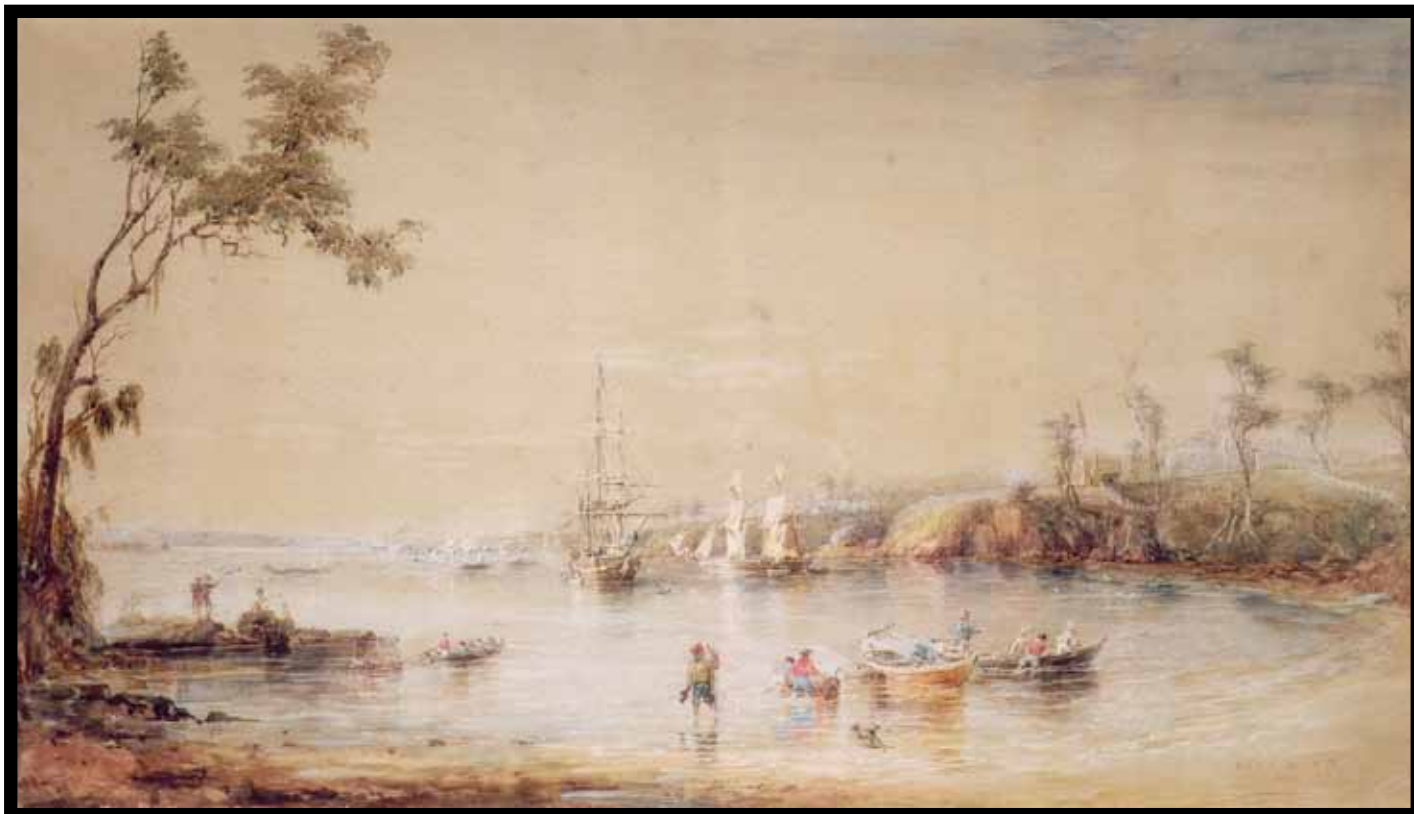
Figure 5. Oswald Brierley's 1847 watercolour of life at Bilgalera (Fisheries Beach or 'East Boyd'). Note the Aboriginal family on rocks known as Toanho which had traditionally been used for gathering shellfish and fishing. The cottage Brierley built is on the first headland. Land about the bay at that time was 'parklike' due to Aboriginal management and use of fire. Brierley developed close ties to the local Aboriginal people, often illustrating them and their places and lifestyle. He also kept illustrated journals of some of his adventures in the region. At other times he managed Ben Boyd's whaling operations. Guided by Budginbro, his journey to the Monaro became the basis for the first European 'road' to the Monaro, built to further Boyd's pastoral empire.