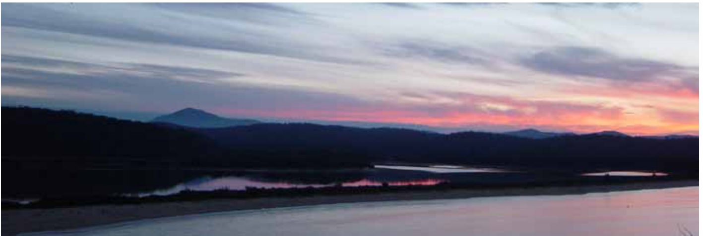
Figure 20. Whale Beach and Kiah Inlet with Balawan (Mt Imlay) at sunset. There are many places of great cultural importance in this scene. The Bundian Way passes through the middle ground and crosses the stream where it is usually at its shallowest. It continues to Beermuna (Boydton) via a very old public road reserve and then generally heads north westerly to the Monaro.

Management of the Bundian Way should be undertaken to the greatest extent possible by Aboriginal people, it is in every regard an ongoing project.